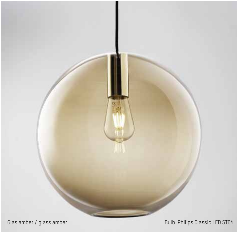
Glas amber / glass amber