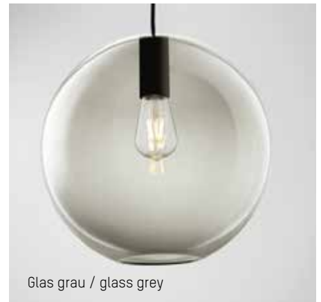
Glas grau / glass grey