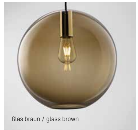
Glas braun / glass brown

Dekorative Hängeleuchte im Retro-Design Hochwertige Glaskugel mundgeblasen in 3 Farben Speziell konstruierte Fassung für bündigen Montage Abhängung in 2 Farben erhältlich Glasschirm separat ordern